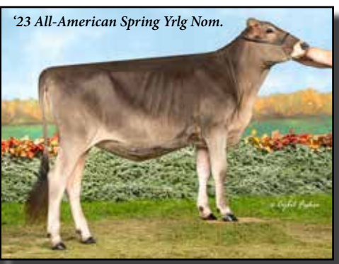
A JOY CP SNOW WHITE