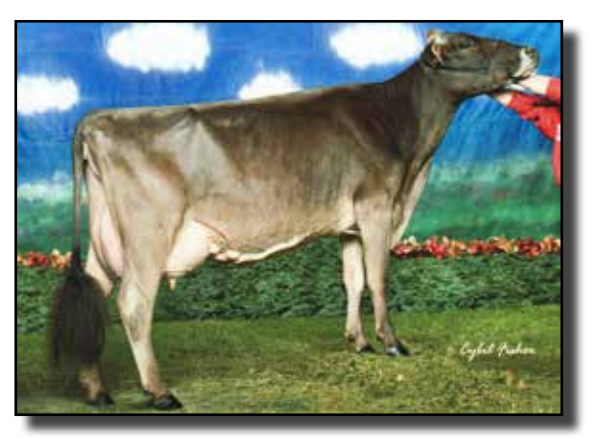
KULP GEN STARBUCK SHANIA '4E94'