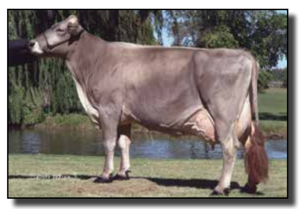
SUN-MADE JETWAY SHATZI ET '4E94'