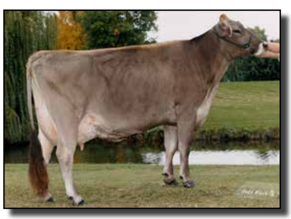
BLUE HEAVEN JW SNOWPLOW 'EX94